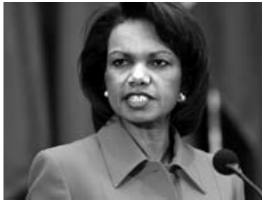
Condoleezza Rice: “This is not a one-size-fits-all effort”

ros Dimas did not attend for health reasons, sources told Europolitics . The other countries present – China, Japan, India, Germany, South Africa, Indonesia, Brazil, Canada, the United Kingdom, Italy, South Korea, France, Mexico and Australia – sent